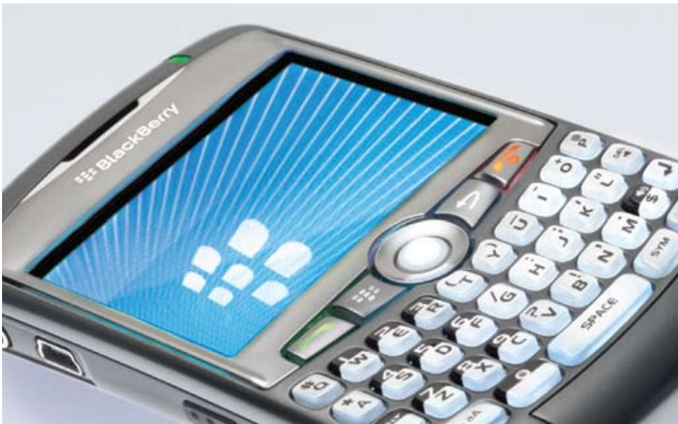
BlackBerry: an unexpected, un-descriptive name can succeed even with a supposedly risk-averse audience

of employees blurting whatever comes to mind will result in a massive list of words, most of which will make a great name. Nothing gets the brain juices flowing faster than a stomach bursting with pizza. Let brainstormers engage and watch their productivity shoot through the ceiling.