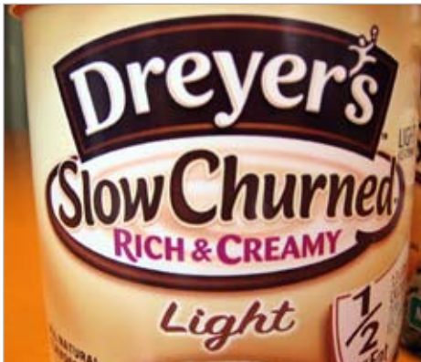
Slow Churned Ice Cream